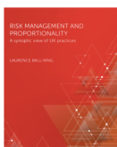
PhD Thesis Risk and Proportionality King's College London